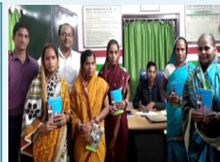
JLG MEMBERS RECEIVED CROP LOAN AT BRANCH OFFICE

Annapurna started the Pilot of its Crop Loan in the month of July. The small and marginal farmers face difficulty in getting timely credit as per their needs. Because of this, they rely of local money lenders, to get immediate credit at higher interest rates. Also, the usual cash flow in farming is seasonal. Because of this, a farmer may not always be able to pay monthly instalments. To address this problem, Annapurna made this product which is highly flexible, and the farmer can borrow in variable loan sizes depending on his crop. The credit facility would be available to them at the beginning of the season without any delay. Also, the farmer will have a variety of flexible repayment schedules to choose from as per their needs. Apart from this, the Company is providing optional weather based crop insurance to farmers. The crop loan pilot is funded by Hivos. This is group loan for growing, vegetables and other agricultural products. Annapurna has started providing the loans in JLG model to the farmers. The pilot has been started in Odisha, in the areas having higher cropping intensity, and double cropping.