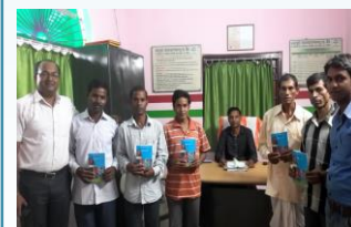
FARMERS RECEIVED CROP LOAN AT BRANCH OFFICE